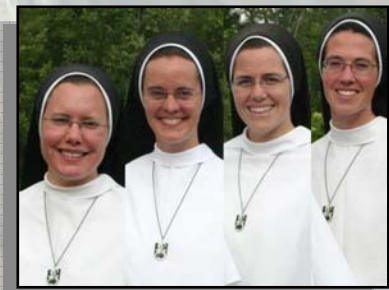
The Dominican Sisters of Mary, Mother of the Eucharist

The Dominican Sisters of Mary will tell us about the establishment of the Spiritus Sanctus academy in Sacramento; a Catholic school steeped in the rich culture and tradition of the Catholic faith. They will emphasize their teaching on God's mercy and involvement with the University of Sacramento.