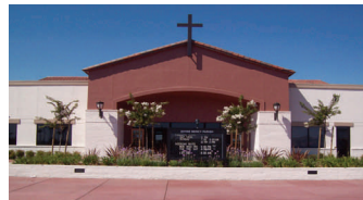
Divine Mercy Parish

can see all the Position Descriptions we have for POC's and participants at the parish level or directors and managers at the administrative level.